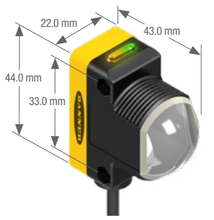
Opposed High-Power Models Suffix EX and RX

Fixed-Field and Expert Models Suffix E, R, LP, LV, D, AF, FF, LLP, LLPC, LVC, EDV, LD and LDL